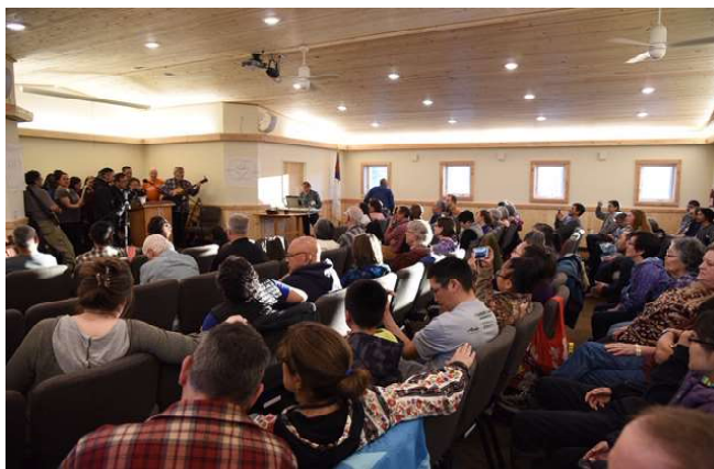
Alaska Covenant Annual Meeting, Mountain Village

Despite the fact that we were unable to send a KICY representative, people at the conferences were willing to be our remote broadcasters, set up and run the equipment we sent, and thus ensure people unable to be at the conference could take part in the